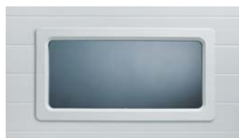
24" X 12" INSULATED GLASS