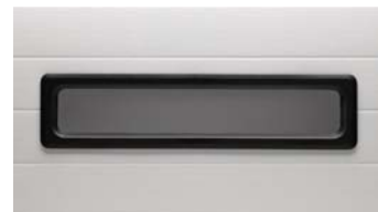
24" x 6" DOUBLE INSULATED ACRYLIC WINDOWS WITH BLACK FRAME WHITE FRAME AVAILABLE (SPECIAL ORDER)