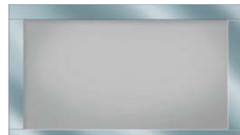
OPTIONAL FULL-VIEW PANEL