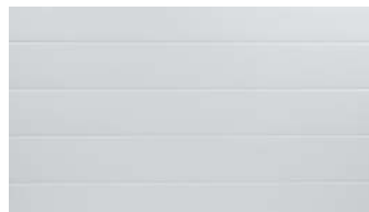
RIBBED PANEL WITH STUCCO EMBOSMENT