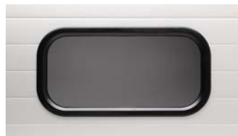
26" x 13" DOUBLE INSULATED ACRYLIC WINDOWS WITH BLACK FRAME WHITE FRAME AVAILABLE (SPECIAL ORDER)